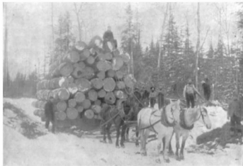
THE HARVEST OF THE PINE.

lack of limestone in the country and consequent bone-making properties in the vegetation; but whether this is the real cause or not, I cannot say. Still the fact remains, and trophy-hunters have often regretted it. The big stag's head, mounted as a hat-rack, adorned my bungalow, thereby, doubtless, fulfilling its destiny.