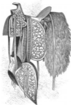
THE COW-BY'S PRIDE.

saddle. The horses run free in a band, which is driven to the corral every day or two, when the animals needed, at the moment are roped (no plains-man, by the way,