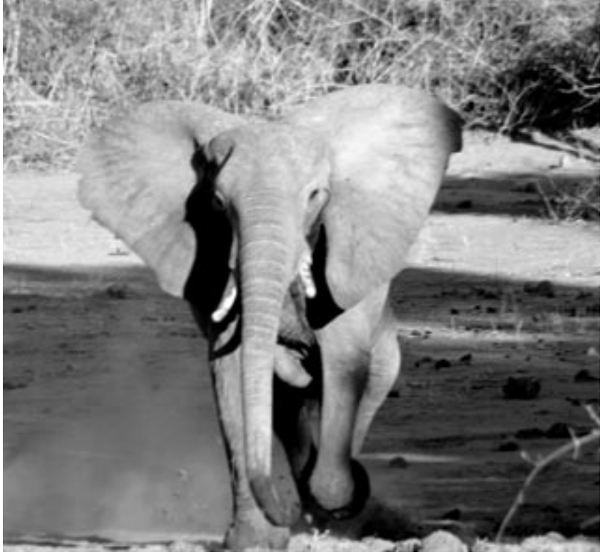
The old matriarch did not like us and performed a brilliant mock charge.

through the coming year. With the outrageous inflation of the Zimbabwe $ even the urban people will not have the funds to buy imported food. A disaster seems inevitable in this once self-sufficient country.