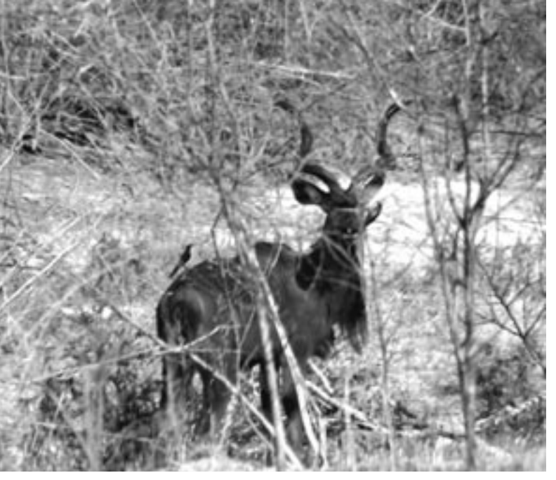
For one reason or the other, the kudu bulls were not sky at all.

range from US$ 10,000 to US$ 15,000. If you add the daily rates for a 14 to 18 day hunt for a trophy bull elephant, it is not the cheapest safari on the market. For those who just want to enjoy the experience of an elephant hunt and don't need the trophy ivory, the much cheaper tuskless elephant hunt may be an interesting alternative. In fact, I was also planing on a tuskless elephant hunt in the neighboring Chewore Safari Area, after my visit to Dande, but unfortunately I had to cancel that hunt because of my tight travel schedule. A tuskless elephant may be a cow or a bull elephant, but in reality tuskless bull are exceedingly rare, so a tuskless elephant hunt is usually a cow elephant hunt.