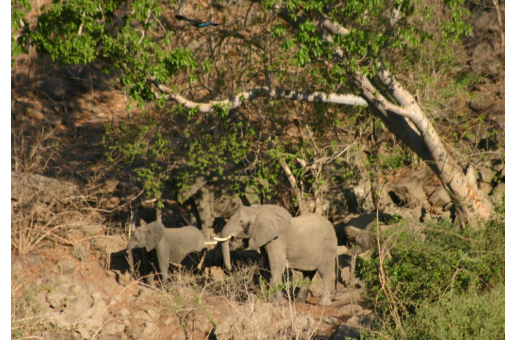
We encountered several different elephant herds every day.

A formidable old buffalo bull with wide and solid boss and massive curls is down.