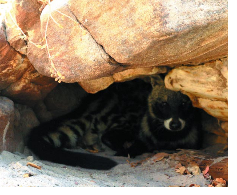
Seeing the elusive civetcat at broad daylight was a very unusual experi-

easy shooting range. Though, if you are seriously after kudu they usually turn into spooky gray ghosts.