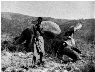
THE FIRST ELEPHANT TO FALL.

below, serene and placid, gently fanning themselves with their enormous ears, quietly standing in the shade of some large thorn-trees, out of the burning glare of noon, sometimes slightly swinging their trunks, sometimes raising them to scent the telltale breeze. Strangest of all, within four hundred yards of where they stood, though out of sight, was a small Somali encampment, and some flocks of goats and fat-tailed sheep were grazing upon the hillside. How gray they looked, not