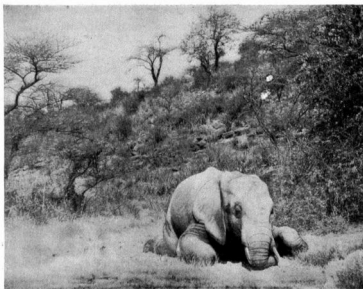
ONE OF THE ELEPHANTS, WHICH FELL DEAD IN A CURIOUS ATTITUDE.

Meantime we deliberated how to deliver the assault. The Somalis wished us to march straight up in the open, and attack them without more ado. This we eventually did; but first we posted ourselves in the ravine, and the men tried to make the elephants move toward us. When we were ready I gave the signal to our beaters; but the elephants refused to move, not knowing where the danger lay, hearing the shouts, but unable to smell or see their enemy.