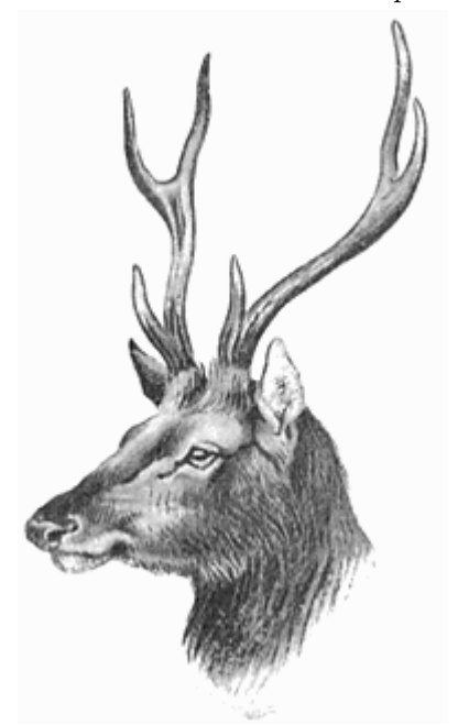
The Celebes variety of the Sambar (Cervus moluccensis).

For a few days after leaving the village Ram's habit was to send forth every morning, as preliminary to the day's hunting, twenty or twenty-five Karens to scour the country for tracks; but they made so much noise I insisted the practice be abandoned, and that the Karens remain in camp well