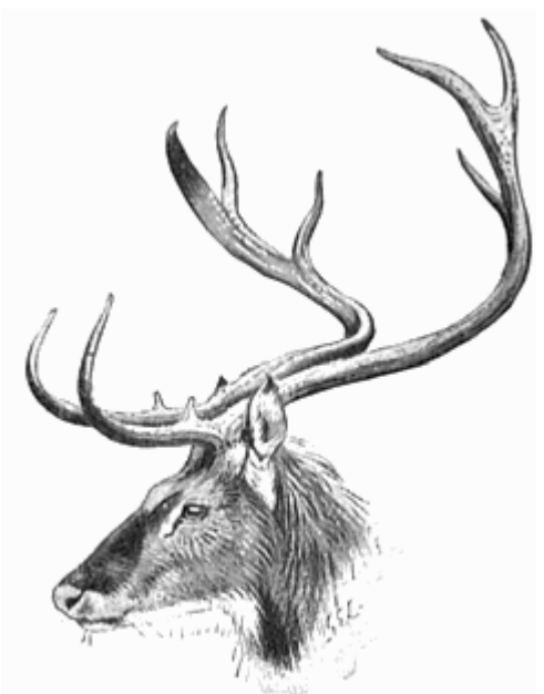
The curiously antlered Thameng of Burma (Cervus eldi).

for there is no other way of hunting in these dense jungles than by following tracks wherever they may lead. Thus it will happen that you may be traveling down wind or up wind. If when you come within striking distance you are going up wind, a lucky star indeed shines over you. If down wind-disappointment, as you hear but never catch sight of the fleeing game. Nowhere in the world I have hunted is successful stalking more difficult than in this piece of Siam-Burma. A tangle of hanging things overhead, of creeping things underfoot, and of thorn bushes on every side, all ready to hold or to prick or to sound instant alarm to the wild folk.