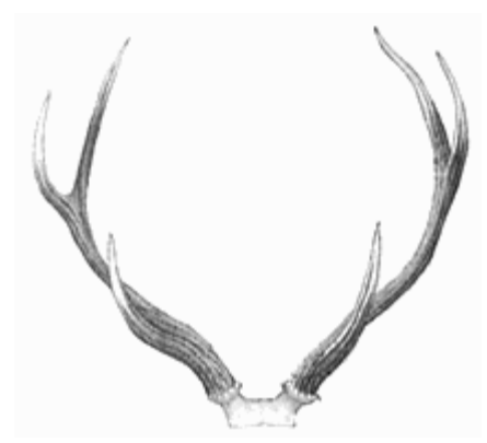
Typical antlers of the Sambar of the Far East (Cervus unicolor).

for there is no other way of hunting in these dense jungles than by following tracks wherever they may lead. Thus it will happen that you may be traveling down wind or up wind. If when you come within striking distance you are going up wind, a lucky star indeed shines over you. If down wind-disappointment, as you hear but never catch sight of the fleeing game. Nowhere in the world I have hunted is successful stalking more difficult than in this piece of Siam-Burma. A tangle of hanging things overhead, of creeping things underfoot, and of thorn bushes on every side, all ready to hold or to prick or to sound instant alarm to the wild folk.