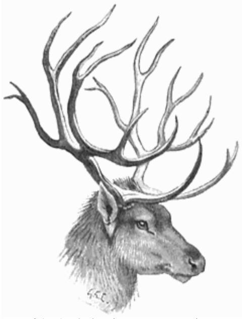
Schomburg's deer (Cervus schomburgki).

Oriental peoples are hunters of deer except by the method of watching from a platform erected near a drinking hole in the dry season. During the rainy season no attempt is made to get deer, and therefore they know nothing whatever of the science of hunting. Truth to tell, hunting craft, woodcraft, is of little service in these dense Far Eastern jungles, because there is no such thing as following game up wind except by chance, or of calculating its probable range and crossing upon it or, nine times out of ten, of circumventing it in any legitimate manner. If ever the hunter gets the game at a disadvantage it is entirely luck;