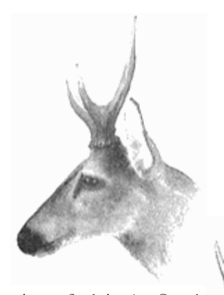
A young South American Guemal whose antlers resemble those of Sambar.

The hog deer of the Indian plains (Cervus porcinus).