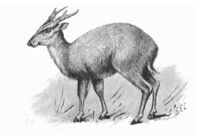
The barking deer (Cervulus muntjac).

We lay down in the jungle to rest until daylight without going to camp, which was far away, and then again—the tracks; but we never saw that buffalo, and I hope no other hunter ever did; for I should like now to think that my bullet made only a flesh wound which never embarrassed the buffalo's progress, rather than that the beast wandered at the mercy of the jungle great cats, to fall an easy victim, or to die the lingering death of the seriously wounded.